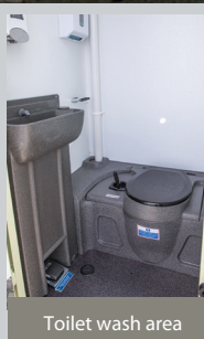
Toilet wash area