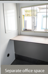
Separate office space