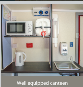
Well equipped canteen