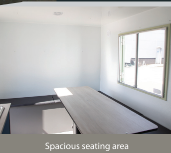
Spacious seating area