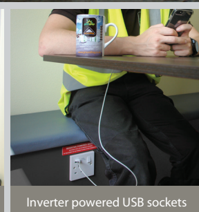
Inverter powered USB sockets